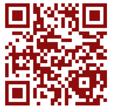
Official group in social net vk.com